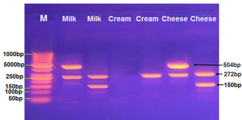
Fig. 1. Shows amplification of enterotoxin genes, sea , seb , and seg at product sizes of 504, 272, and 150bp respectively. Ladder is 1000-50bp