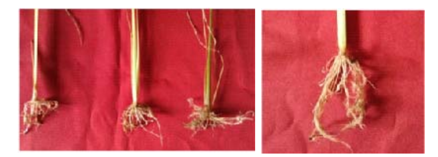
Plate 1. Infected rice root with M. graminicola on basmati rice germplasms

germplasms were recorded to be Moderately resistant with scale 2. It has also been noticed that 23 germplasms were evaluated moderately susceptible with root knot index scale 3 and susceptible germplasms were Shaan (Hybrid), UPR 3805-12-2-7, MAUB-2014-1, SJR 129-2-2, IR 64, Pusa RH 101 and Pusa RH 102(Table 4). The maximum length of root and shoot were also recorded in Pusa 1637-18-7-6-20 followed by NDR 6257. (Fig. 2)