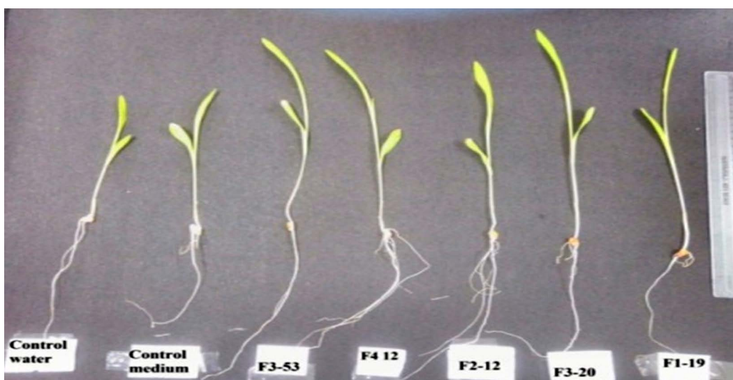
Fig. 1. Observation of paper towel method

Result shows that shoot length varied between 15.27cm to maximum of 25.5cm. Among these five isolates F 3 20 showed more length (25.5cm) which is more than control height which was 15.27cm. Similar results were obtained for root length and for other growth parameters also. The results of all parameters indicated that