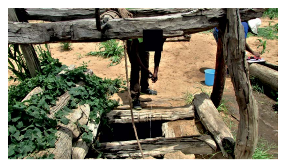
Fig. 3. A picture of type 3 deep hand-dug wells found in Ohangwena and Omusati regions of the CEB in which animals cannot walk into the water.

and -403.6 Mv to 141.2 Mv in the dry season. The NMS analysis performed had a total of 500 iterations upon which a final solution was reached with a stress of 11.807 and a final instability of 0.000001. NMS results revealed that the main physical factors that influenced the distribution of human pathogenic bacteria in hand-dug wells were temperature r=-0.628 tau=-0.365 and pH tau=0.645 tau=0.401. pH was positively correlated with the wet season while temperature was correlated with the dry season (Fig. 5).