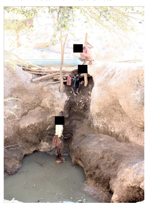
Fig. 2. A picture of type 2 shallow hand-dug wells found in Ohangwena and Omusati regions of the CEB in which animals cannot walk into the water.