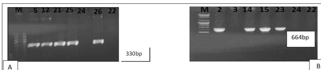
Fig. 1. A: Electrophoresis gel of PCR product of phzM genes. Lane L: DNA marker (100-1500bp); Lane (24) negative control; Lane (22) environmental isolate; Lane (5, 12, 21, 25, 26) clinical isolates give a positive result for this gene. B: Gel electrophoresis of PCR product of the phzS gene. Lane L: DNA marker (100-1500bp); Lane (24) negative control; Lane (3, 22) environmental isolates; Lane (2, 14, 15, 23) clinical isolates